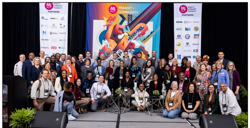
Pottstown Area Regional Delegation at the MPact Conference 2024.