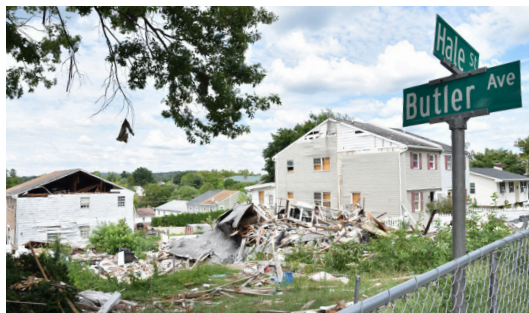
With the investigation into the cause ongoing, the site of the explosion remains largely as it was following the blast.

Pottstown nonprofits raised over $114,000 in the two months since the May 26 Hale Street explosion resulted in a devastating loss of life and created continuing hardship for dozens of community members in the neighborhood. The generosity of individuals, church congregations, and other organizations across the