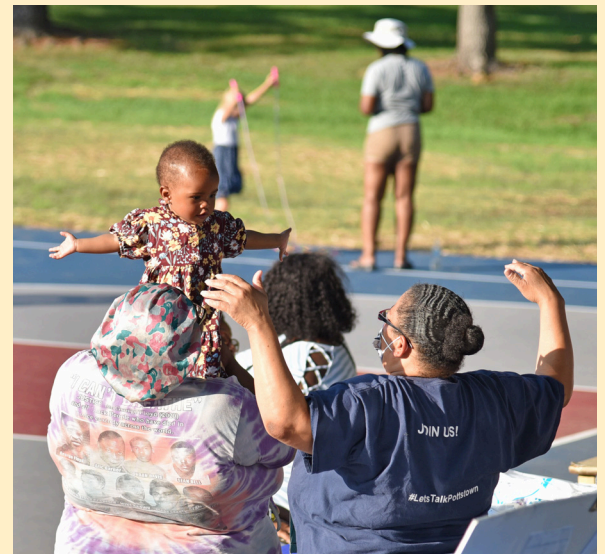
Pottstown families come together during the August 11 Play Streets event at Spruce Street Park.